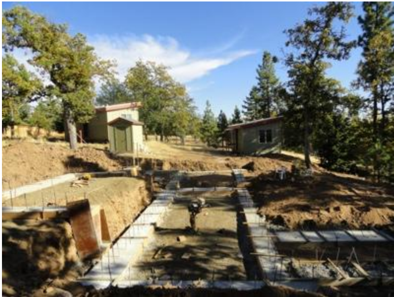
An early stage of construction on the new residence

A major focus for the KCC community over the last fourteen years has been the completion of a long term retreat facility at SCOL. In the last couple of years, we have enjoyed having most of the pieces in place—cabins, a main building with two wings, etc. However, there was still the looming project of planning and fundraising for the construction of a separate residence for stipend volunteers. It is therefore both exciting and relieving that, on September 24th, KCC broke ground on this final building of the retreat cloister and construction is now underway.