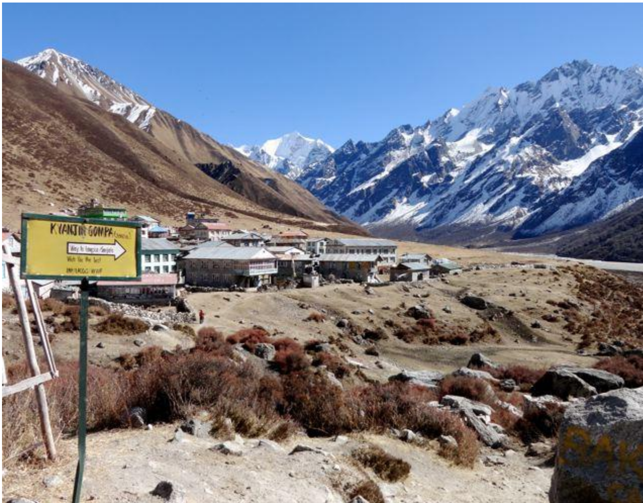
Village of Kyanjin

We visited the room where the elders practice and study, with a simple shrine, the seat where the lama teaches, a pile of exercise books where the students had written the Tibetan alphabet over and over, and materials for mandala offering identical to those we use in KCC’s Mahamudra program. I was flooded with gratitude for the Dharma, for KCC and the authentic teachings we receive, and for the interconnectedness that brings us all together across such vast geographic and cultural distances.