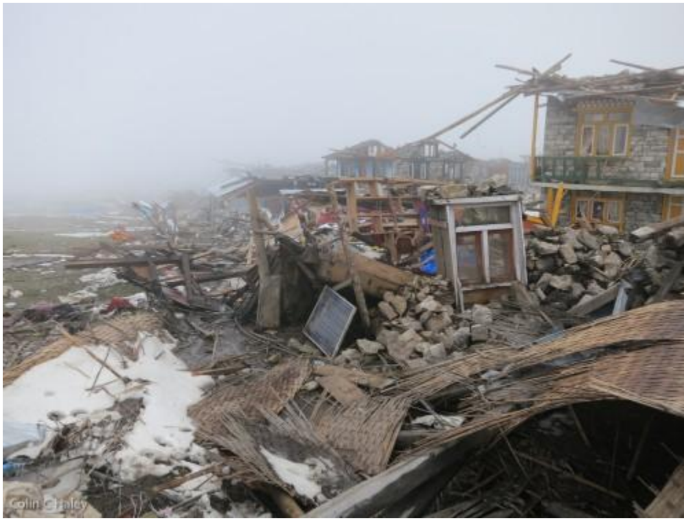
Kyanjin village after the earthquake.