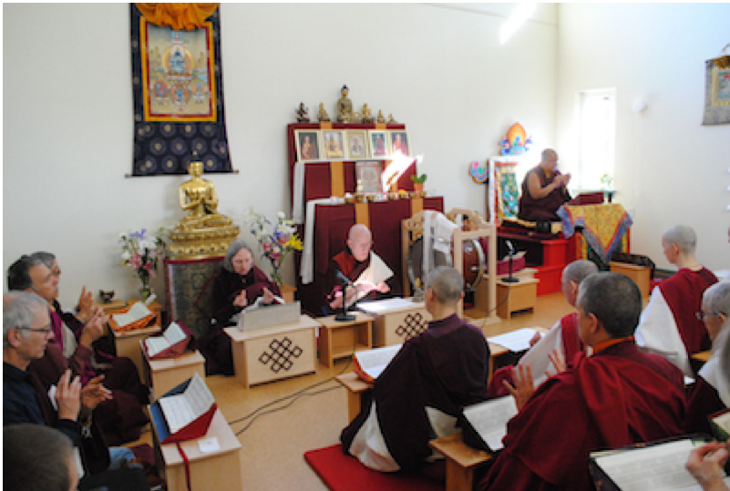
Green Tara Puja